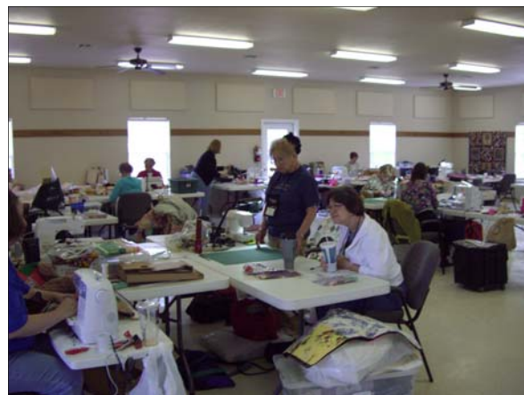
The left side of the room working hard