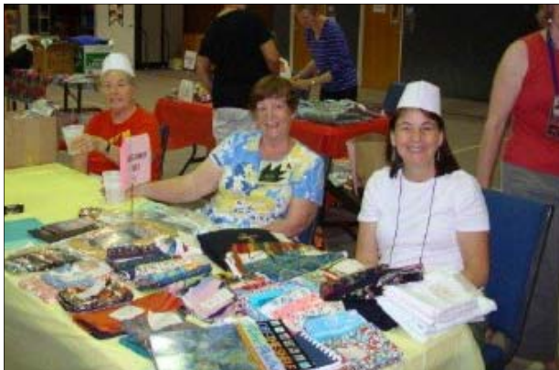
Booths offered lots of fabric, patterns and good deals!