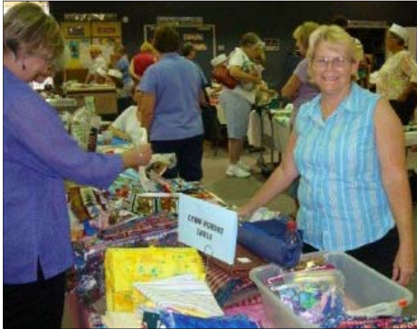
Fabric shopping was enjoyed by all!