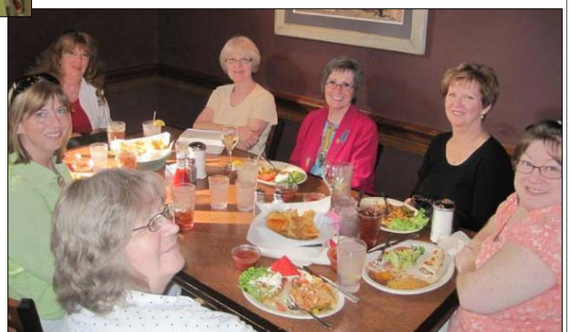
A Dutch-treat dinner enjoyed prior to the workshop