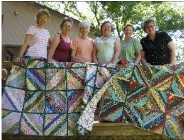
The Fabriholics Bee