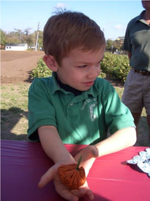
Student shows off his handiwork at Nash Farms.