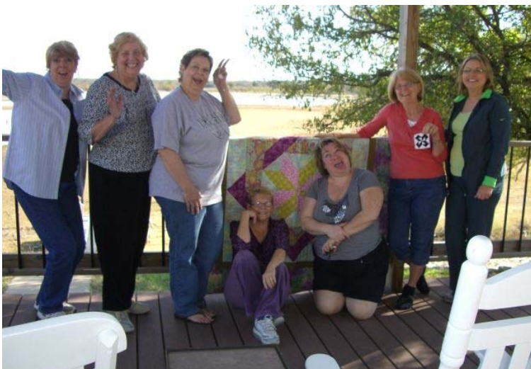
Girls Having Fun!