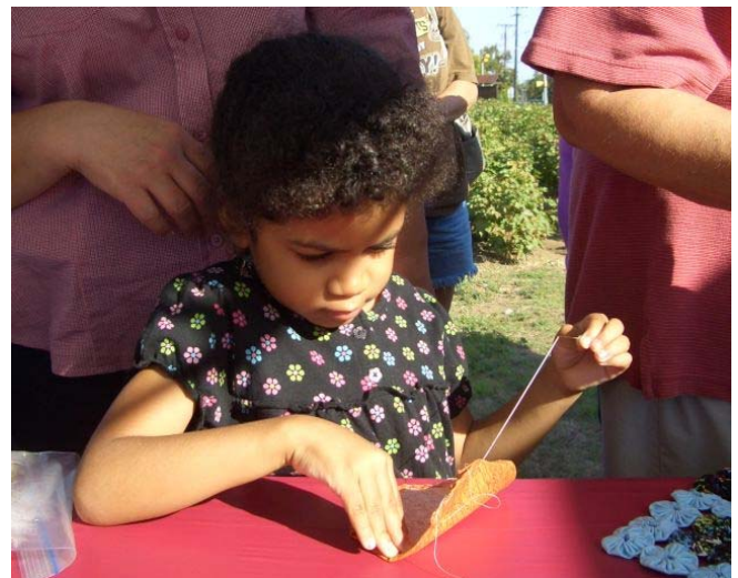
A future quilter works on her first yo-yo.